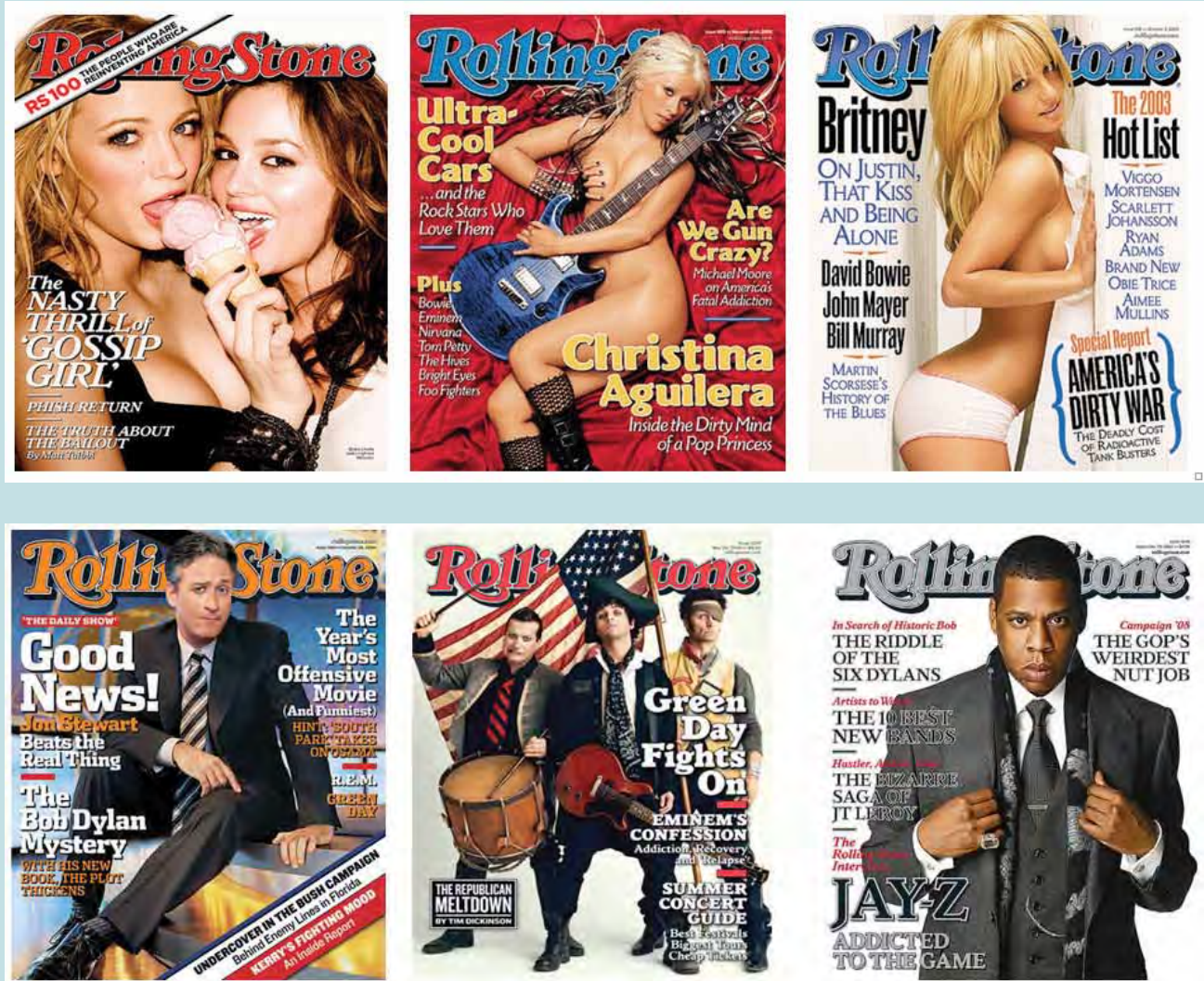
How are actors and musicians depicted differently, depending on their gender?

While teens receive many societal messages about gender and sexual norms, sex should be relatively new to teens. Because of this, teens may be vulnerable to confusion around consent, lack of consent, force and sexual assault. For example, a teen may label a violent assault as merely an “unpleasant” sexual experience and therefore ignore her or his “internal compass” indicating it was a sexual assault. Adolescents who have been victimized as a child may be even more vulnerable to confusion about when sex is consensual and when it is forced. Confusion may be compounded for teens who are exploring or struggling with their sexual orientation or gender identity.